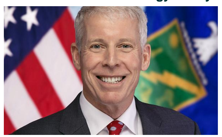
USA Sets Out New Energy Policy

The 6th edition of the Sustainable Energy for All Global Forum took place in Bridgetown, Barbados on 12 and 13 March 2025. With the theme of "Sustainable Energy for Equity, Security and Prosperity", the forum sought to catalyse investments and action towards addressing global energy needs in a clean and sustainable manner. The event was graced by high-level speakers across the world including the COP29 President; COP30 President-designate; H.E. Mia Amor Mottley the Prime Minister of Barbados; among others. More here.