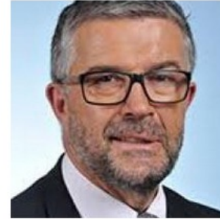
Deputy Bertrand Pancher

Leader of the Committees on North Korea & Reform of Budget & Corporate Tax, Japanese Diet