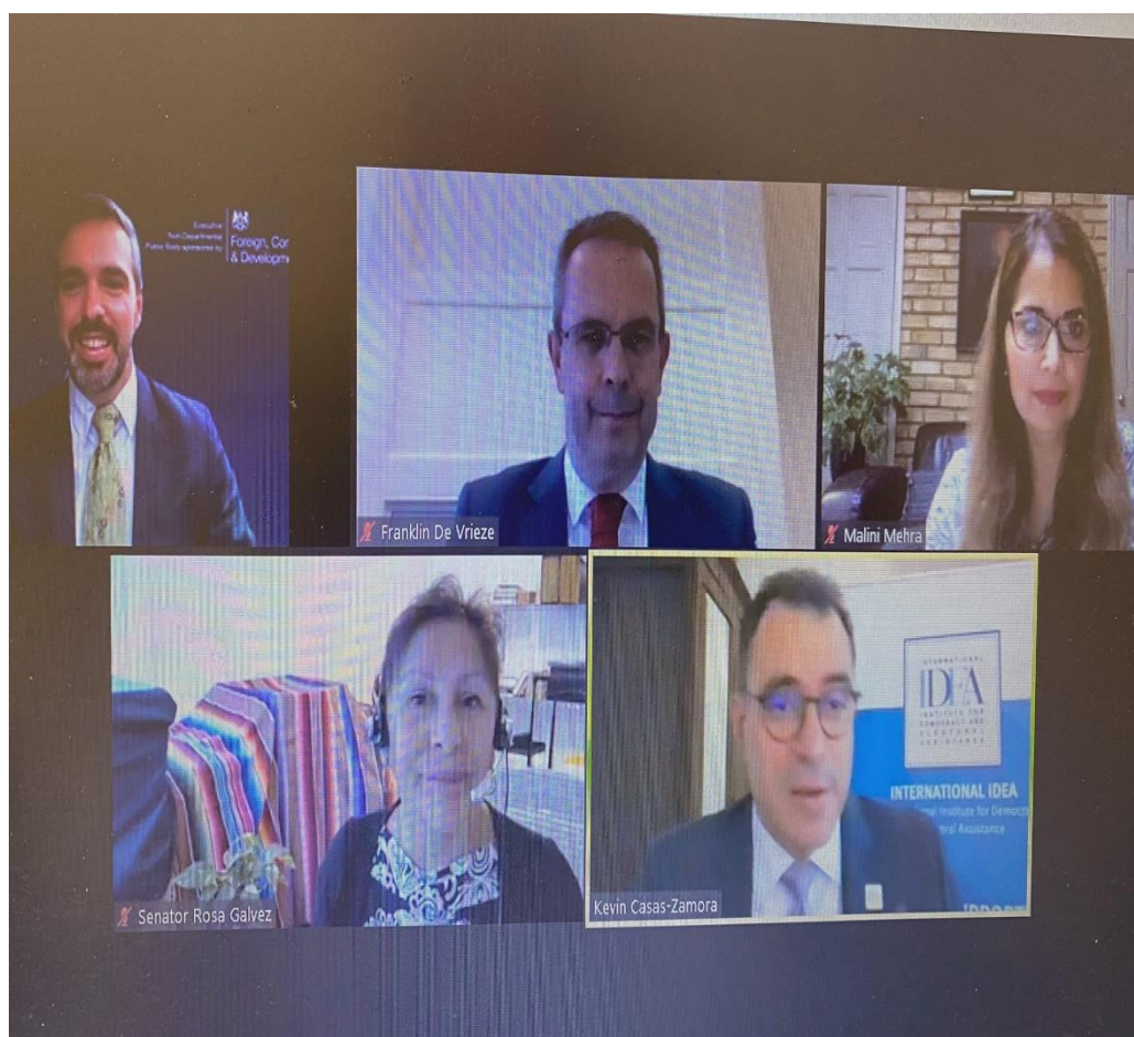
Panelists at the launch

On Friday, September 24, 2021, the report Parliaments and the Paris Agreement: Strengthening Parliamentary Engagement in the Development and Implementation of International Climate Commitments. An Overview of Emerging Global Experience jointly developed by Inter-Pares, ParlAmericas, GLOBE International, and Westminster Foundation for Democracy, was launched at a high-level virtual event as part of the Climate Week New York. It chronicles good practices by parliaments the world over, what parliaments can still do to help their nations in meeting their Climate Change obligations and can be downloaded here: https://bit.ly/3zH6kBX