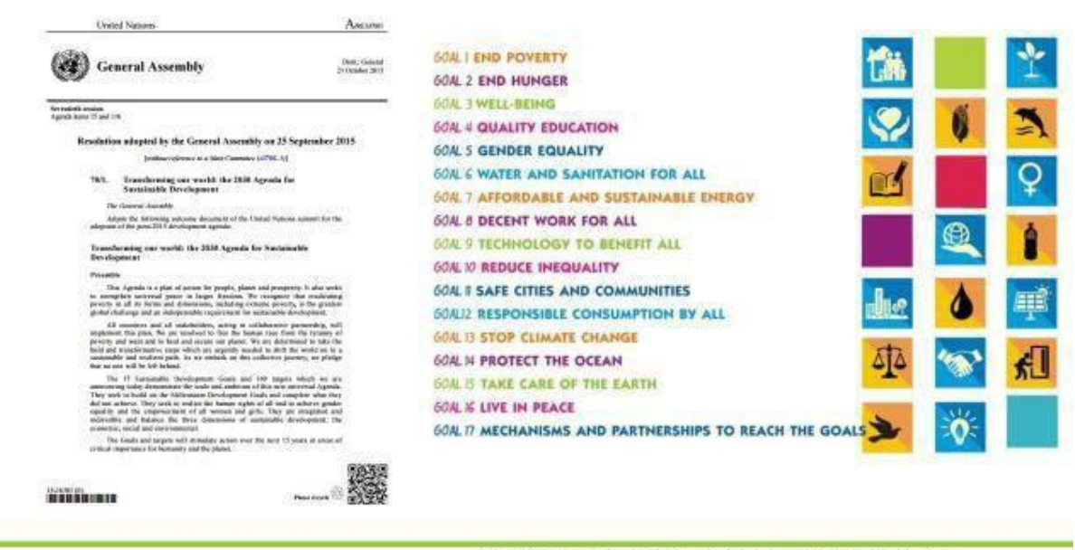
UNITED NATIONS SUSTAINABLE DEVELOPMENT GOALS

Of the major 2015 summits, however, the UN Sustainable Development Summit in New York in September and COP21, the UN climate change summit in December in Paris, were by far the most prominent with the greatest media and political attention, and global campaigning behind them. The climate summit was seen as a moment of redemption following the spectacular failure of the last major climate summit in Copenhagen in 2009.