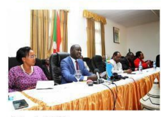
Rt. Hon Daniel F Kidega Speaker, East African Legislative Assembly